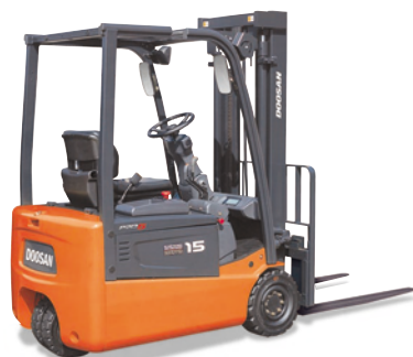
B15T / B18T / B20T - 5 Capacity Range 1500 - 2000kg 3 Wheel