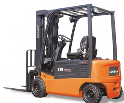
B16X / B18X / B20X - 5 Capacity Range 1600 - 2000kg 4 Wheel