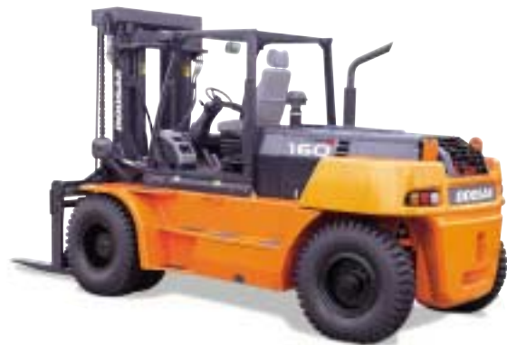
D110 / 130 / 160S-5 11,000 kg , 13,000 kg , 16,000 kg Diesel , Pneumatic Tire