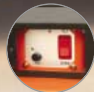
one touch tilting cabin switch